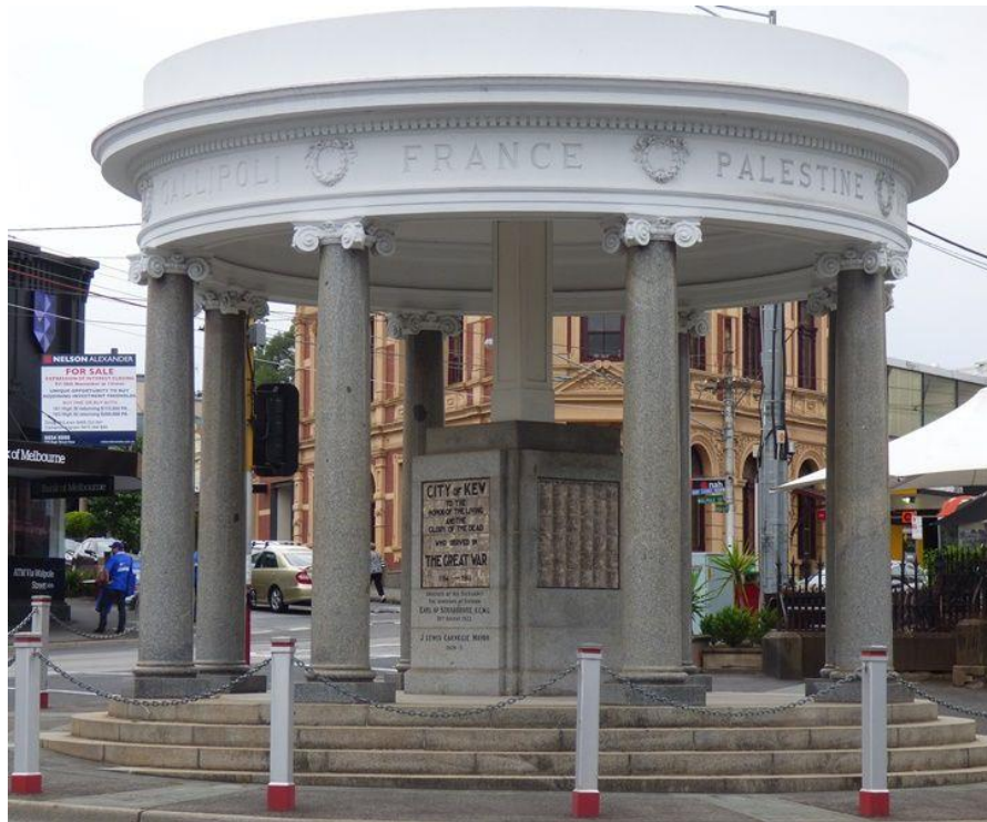
Kew War Memorial