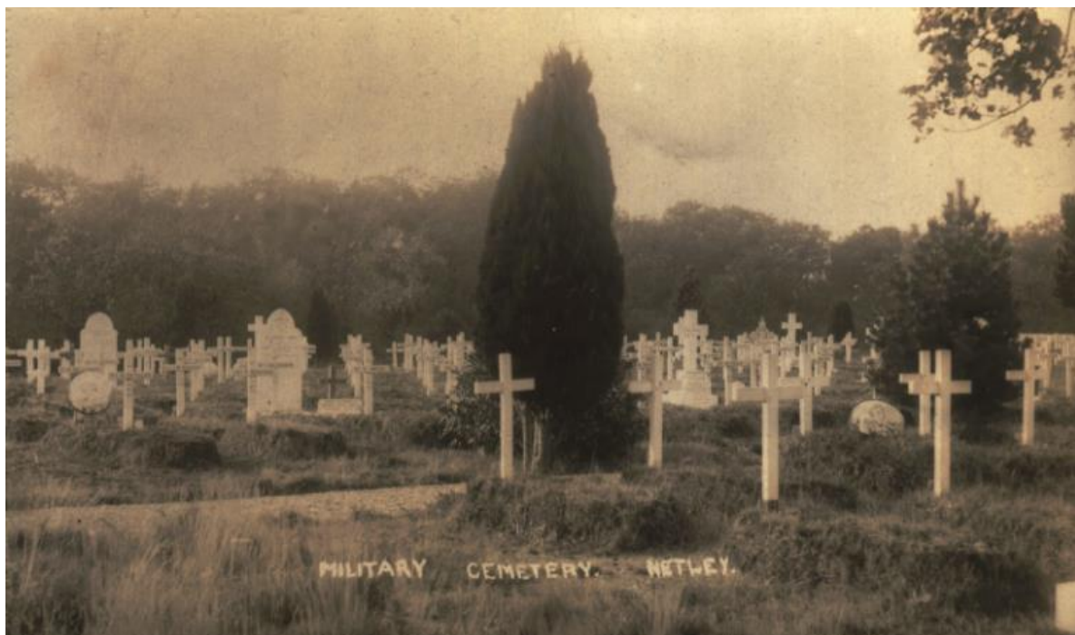
Original Cross markers – Netley Military Cemetery